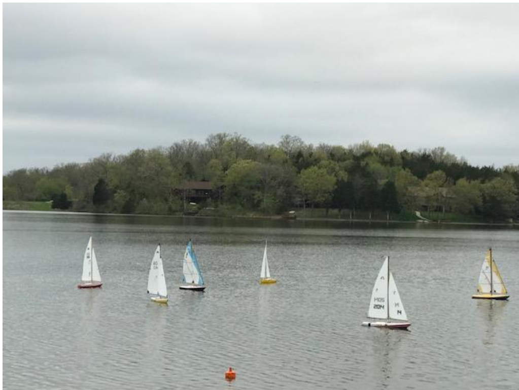
Sailboats at the lake Innsbrook, MO